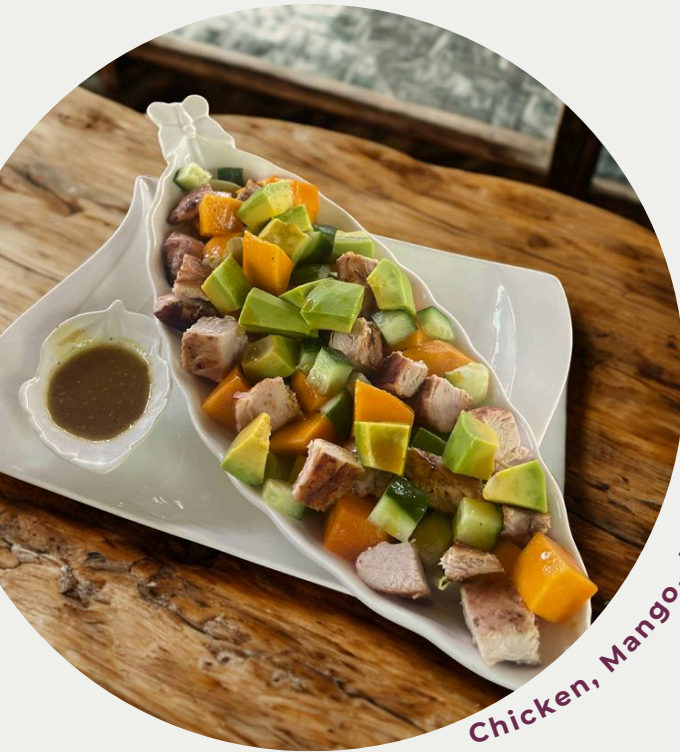
Chicken, Mango, Avocado Salad