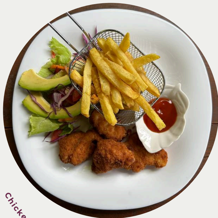
Chicken tenders & dip